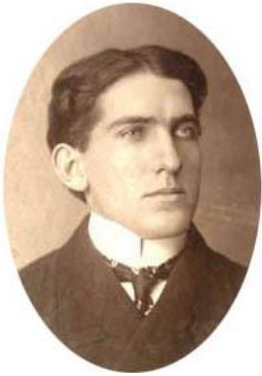
1897 Arbutus Yearbook Indiana University